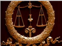
TGI de NANTERRE JUGEMENT

[The dossier: China–USA, "A war without limits" French TV report]