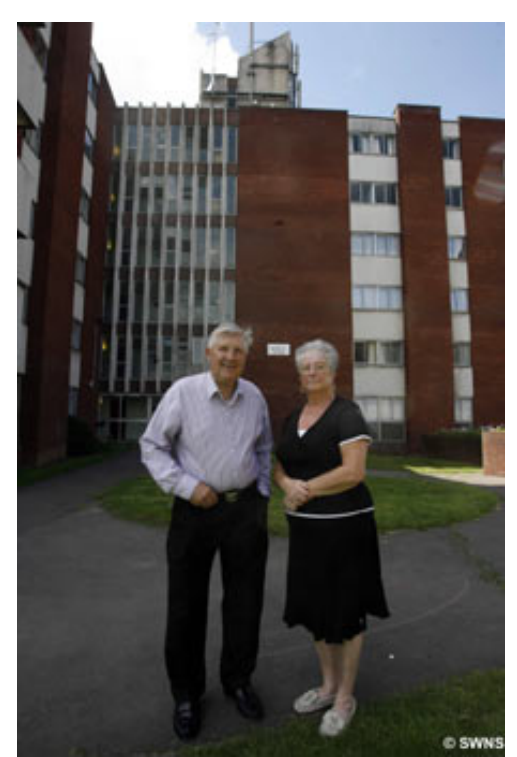
Danger zone: Residents at this Bristol flat have suffered illness and death

Both masts were erected in 1994. South Gloucestershire Council served a notice asking for them to be removed when the ten-year contract expired three years ago.