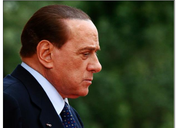
Silvio Berlusconi facing reality

Monday, June 13 th , at 8:00 PM, we'll know if Italy is joining the group of countries that decided to phase out nuclear power.