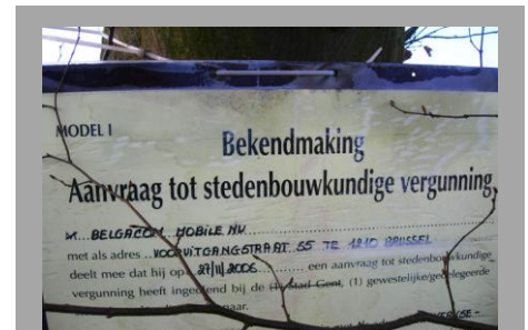
Belgacom planning notice Drogenen ZOOM

The action group hopes also that this verdict will set a legal precedent.