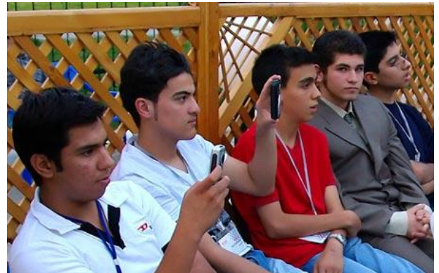
Adolescents with their mobile phones in Tachkent.