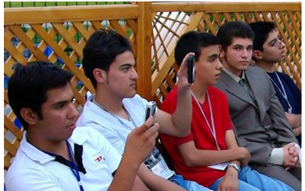
Adolescents with their mobile phones in Tachkent.